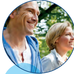
Morning walks & news programs

No matter where you are or what you're doing, Wi Series is designed to make listening easier. It's the ideal hearing aid for people who are active and on the go, enjoy spending relaxing time at home — or both.