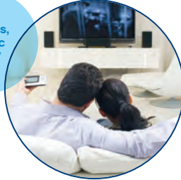
Movies, music & TV