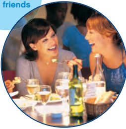
Dinner and a night out with friends