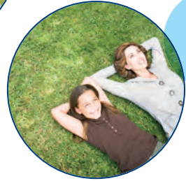
Birds, crickets & the wind